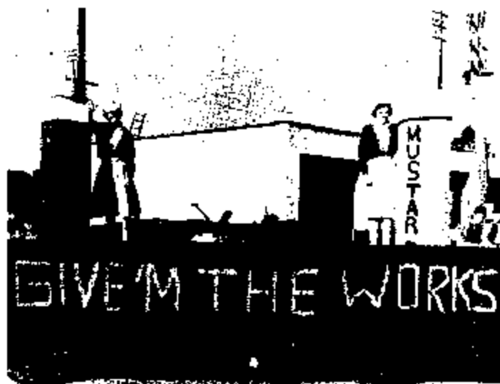
PRIZE WINNING FLOAT MADE BY THE JUNIOR CLASS