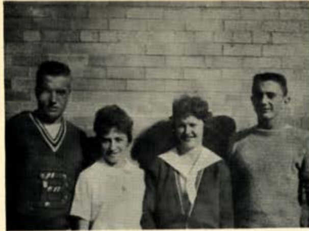
KING, QUEEN, AND SENIOR REPRESENTATIVES