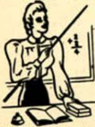
The Future Teachers

Clearly, it is much more useful for the school to know what each student's mental profile is than to know merely what his IQ is. So far, we have barely started to obtain the information that we need to have about intelligence, although our present knowledge enables us to do a good deal better job of judging mental abilities than was possible twenty years ago. Undoubtedly, more primary abilities will be identified and some of the conclusions we have reached may have to be changed. Eventually, additional information should make us quite skilled when planning the best possible education for each child and in selecting the right people for each kind of work.