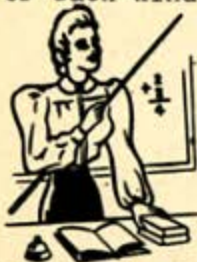
The Future Teachers

Clearly, it is much more useful for the school to know what each student's mental profile is than to know merely what his IQ is. So far, we have barely started to obtain the information that we need to have about intelligence, although our present knowledge enables us to do a good deal better job of judging mental abilities than was possible twenty years ago. Undoubtedly, more primary abilities will be identified and some of the conclusions we have reached may have to be changed. Eventually, additional information should make us quite skilled when planning the best possible education for each child and in selecting the right people for each kind of work.